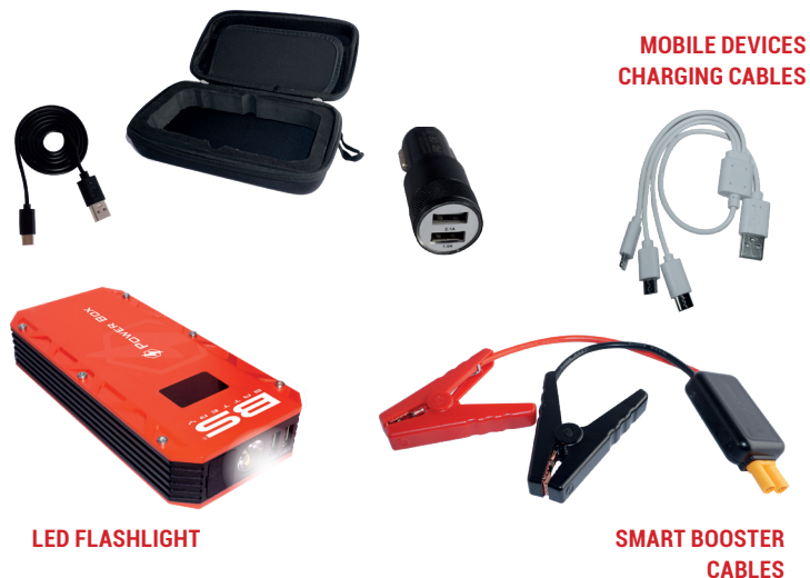
MOBILE DEVICES CHARGING CABLES