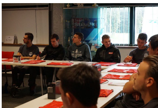
BS Battery Academy - Le Mans Sud high school – October 2023