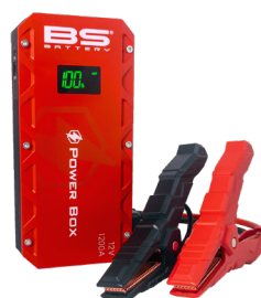
POWER BOX SAFE BOOSTER & POWER SUPPLY FLASHLIGHT 12V - 1200A BS Code: 700556