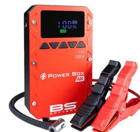
POWER BOX AIR SAFE BOOSTER POWER SUPPLY AIR COMPRESSOR & FLASHLIGHT 12V - 1200A BS Code: 700589